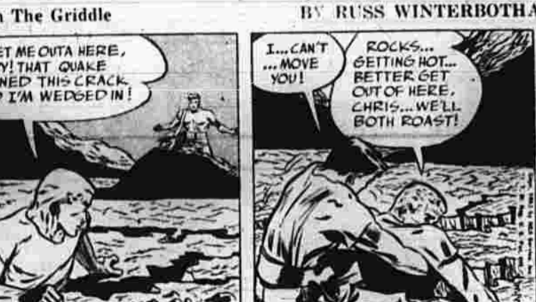
On The Griddle