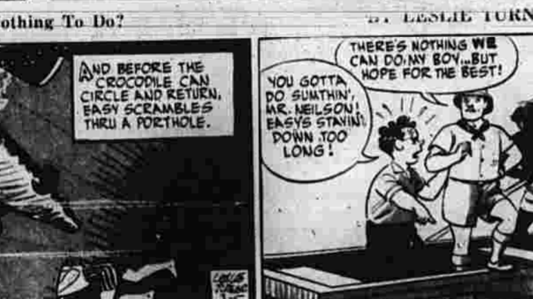
Nothing To Do?