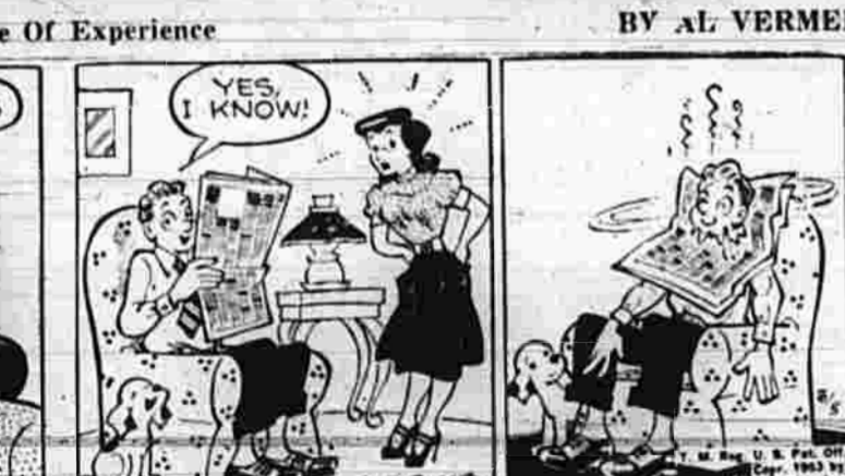
Voice of Experience