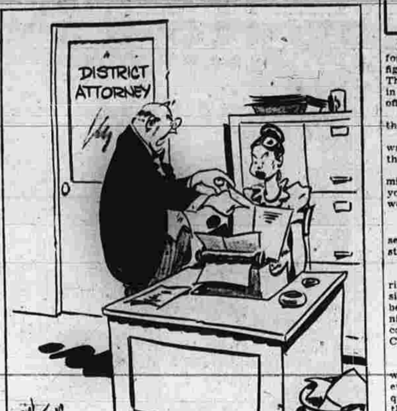
Sense and Nonsense