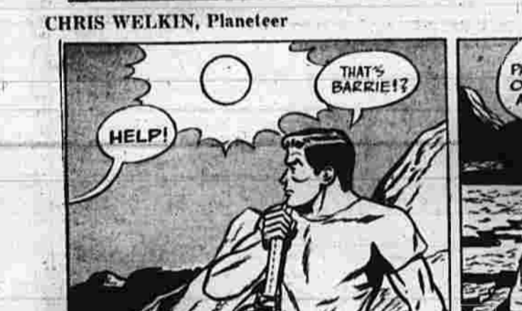
CHRIS WELKIN, Pianeter