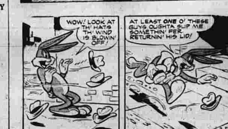
WOW! LOOK AT THAT!