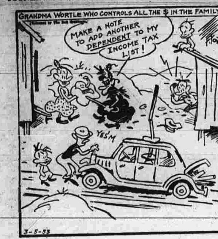
GRANDMA WORTLE WHO CONTROLS ALL THE $ IN THE FAMILY