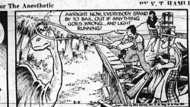
Ready For The Anesthetic