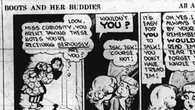
BOOTS AND HER BUDDIES