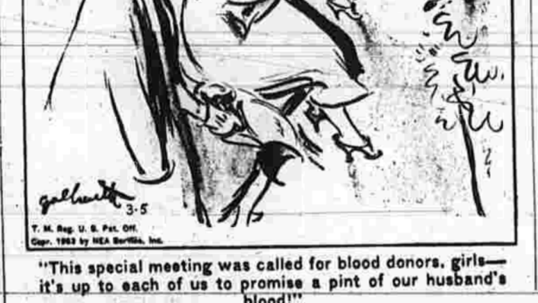
This special meeting was called for blood donors, girls—it's up to each of us to promise a pint of our husband's blood!